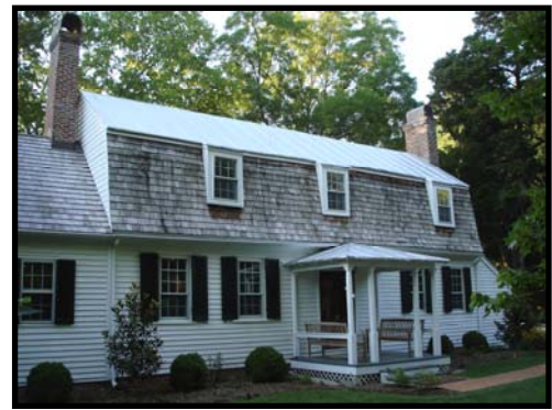
Little Egypt, July 2008